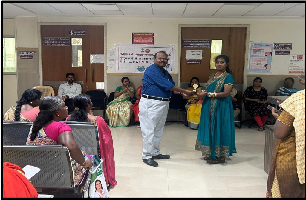
HEALTH TALK ON 'HEALTHY TIMING AND SPACING OF PREGNANCIES FOR WELL BEING OF MOTHER AND CHILD'