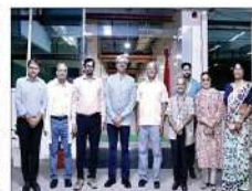
न्यूरो डायग्नोस्टिक लैब की शुरुआत करने के उद्देश्य के तहत एक सभा।