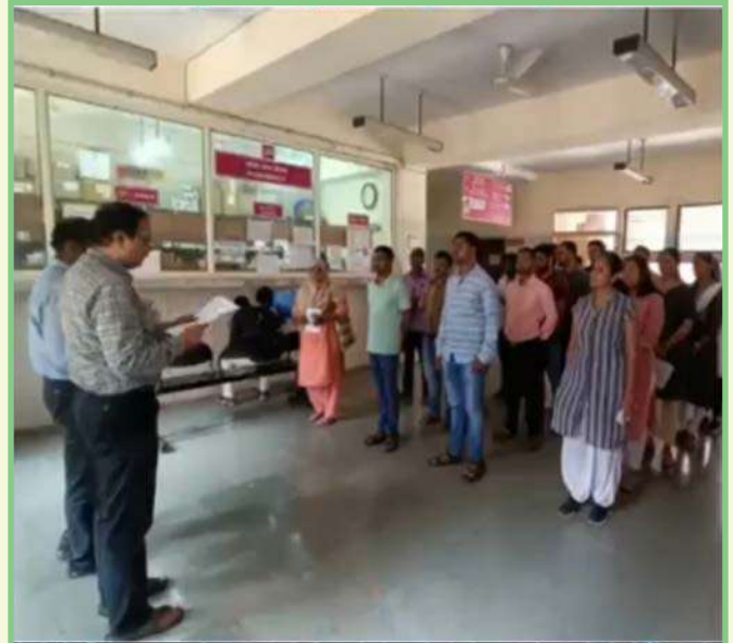
ESIC HOSPITAL, KOLHAPUR