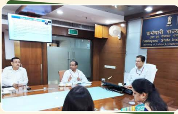
Vigilance Awareness Week 2023

15 th September to 2 nd October, 2023 Special Campaign 3.0