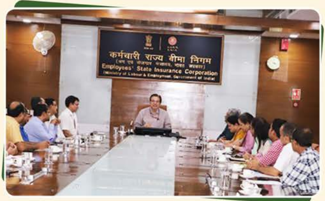
राजभाषा पखवाड़ा का आयोजन