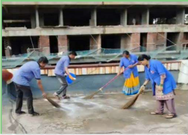
SUB REGIONAL OFFICE, THANE

(15.09.2023 - 02.10.2023) at multiple locations across the country. Everyone present during the drive joined in the initiative to keep the surroundings clean and healthy.