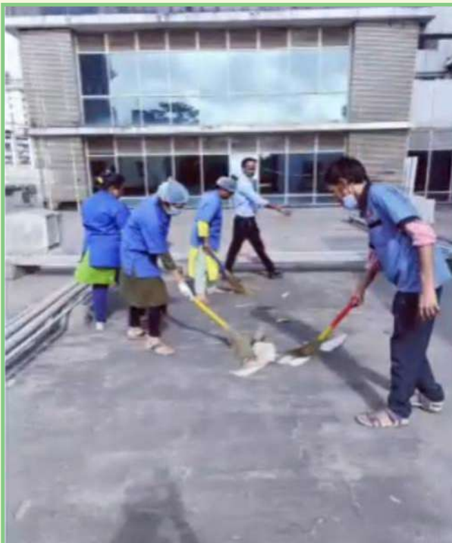
ESIC MODEL HOSPITAL, ANDHERI