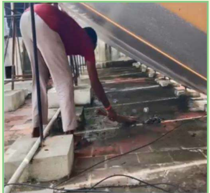
REGIONAL OFFICE, CHENNAI